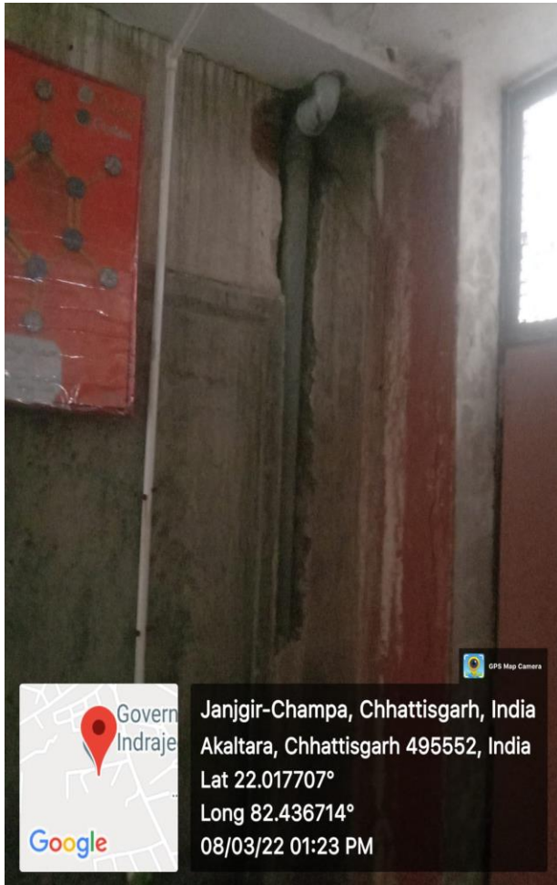
Pipeline from roof to ground