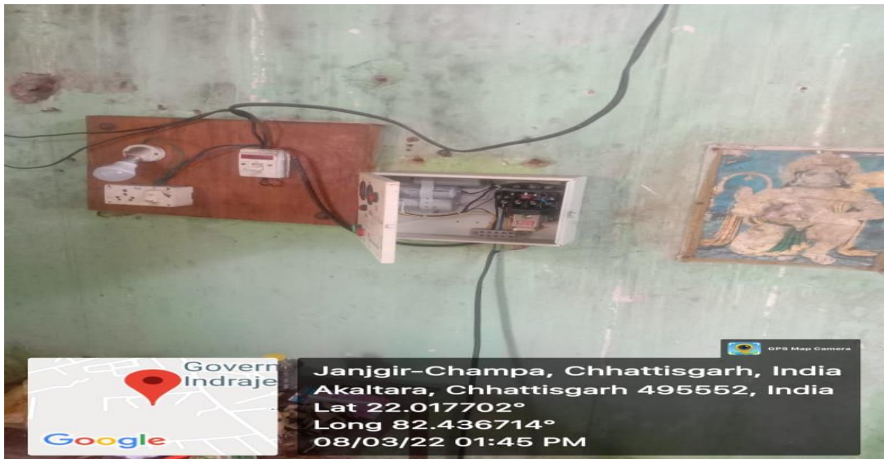
Electric Connectivity for Bore Well