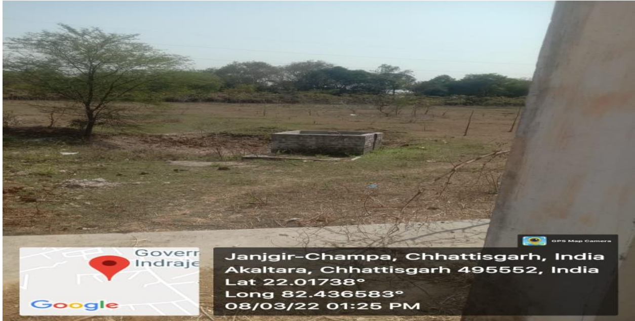
Underground pipeline to tank